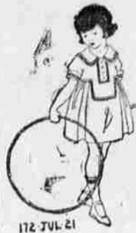
112 JUL 21