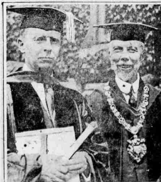
Dr. James Howard Angell (left) and Dr. Huxley at the installation ceremonies when Dr. Angell became Yale's 14th president, succeeding Dr. Huxley. The latter was president 22 years.