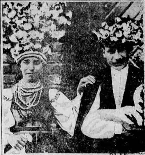
In Poland it's proper to include in the resort of a wedding groom wore roses and forget-me-nots. When he's led to the altar, he wears a wreath of paper flowers, supplied by the bride from her mous floral headdress.