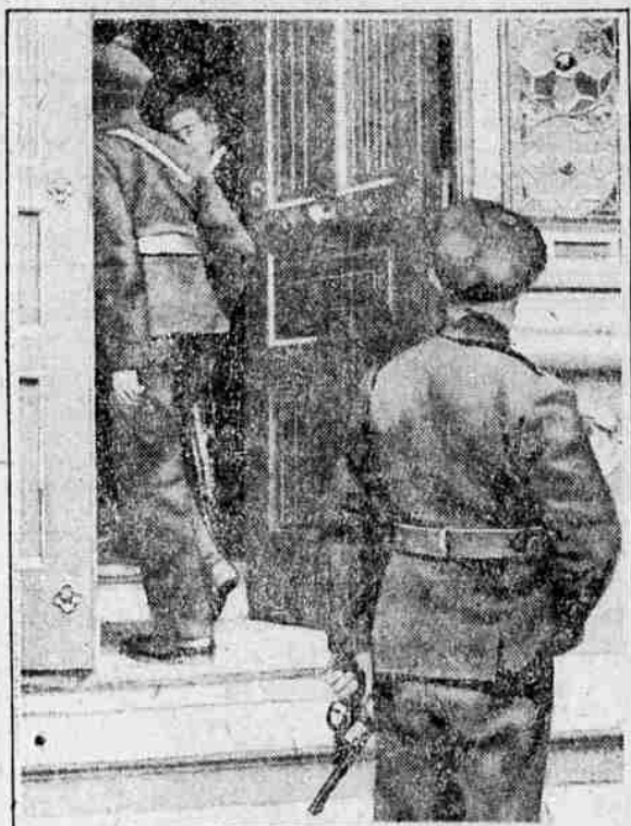
This is the first picture to reach America showing the recent raid of British soldiers on the Dail Eireann headquarters, Henry street, Dublin. These soldiers are guarding the rear of the house.