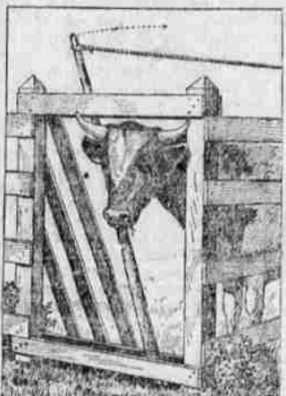
A Gate, Rigged Up So as to Leave Only an Opening Big Enough for the Animal's Head, Is Useful When the Animal Is to Be Marked or Dehorned.

When ready to dehorn or mark a large strong animal, drive her toward the gate. Just as she passes her head by the pole, pull it over against her neck, and she is easily held. There