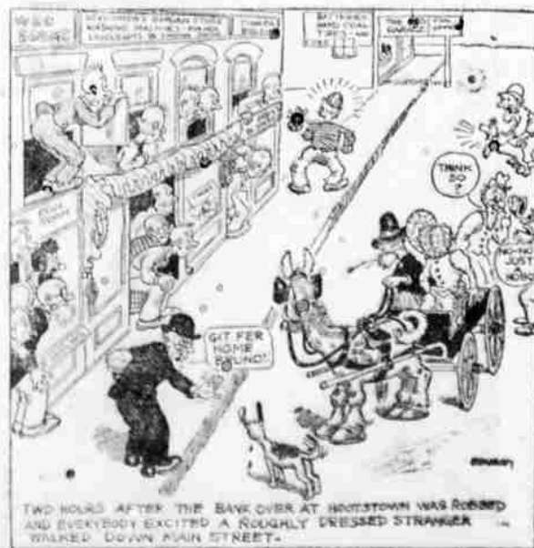
TWO HOURS AFTER THE BANK OVER AT HONOLULU WAS ROBBED AND EVERYBODY EXCITED A ROUGHLY DRESSED STRANGER WALKED DOWN MAIN STREET.