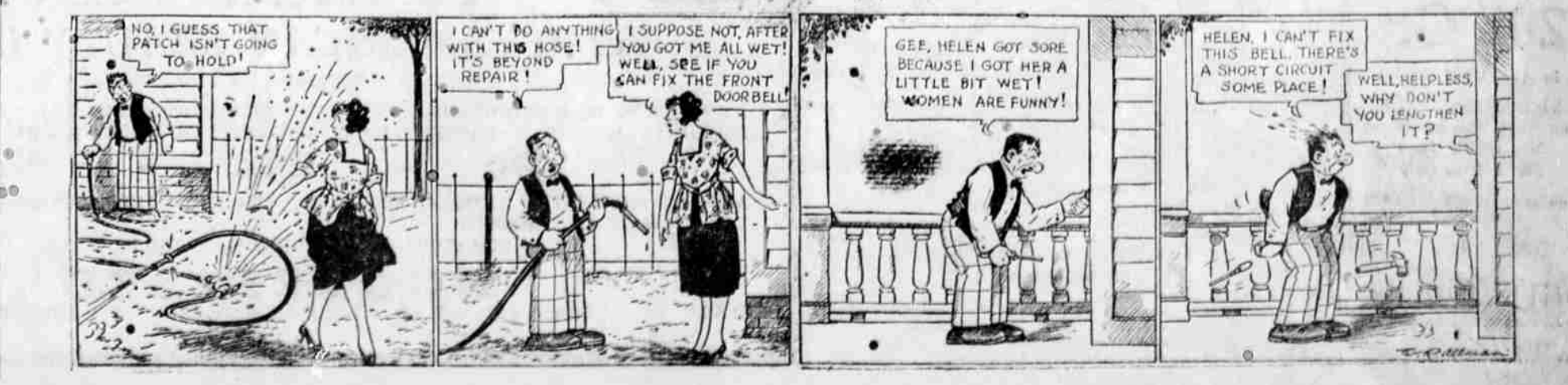
IT'S SO SIMPLE TO HELEN