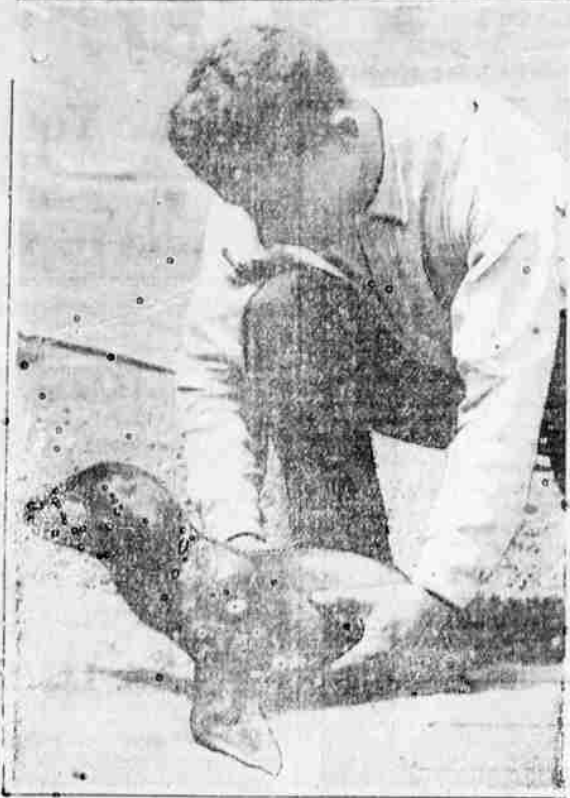
This little flapper is the only sea lion ever born in captivity to live a full sea lion must be kept dry as it does not learn to swim until six weeks old. So a sun parlor has been built for it on the roof of the aquarium in New York. Dr. Townsend, the director, keeps a watchful eye on the flapper.