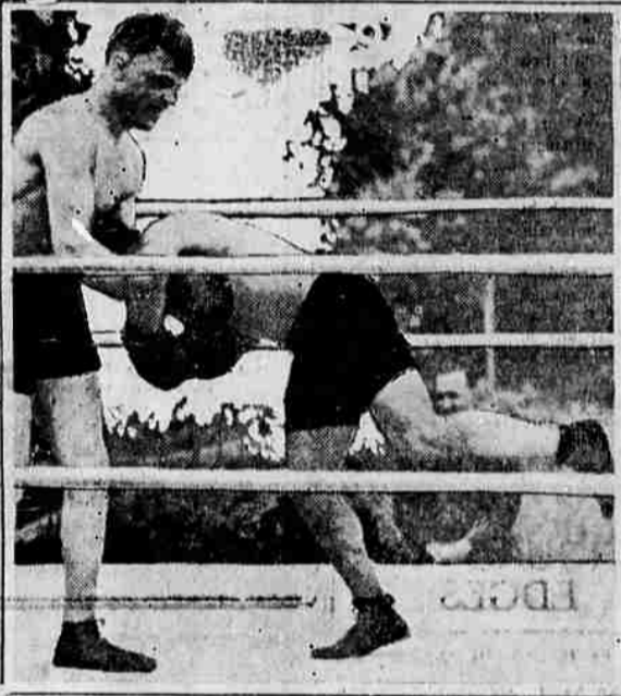
Georges Carpentier's sparring partner, laughing when Georges slipped and rained his head into his, goat fashion. Such a slip in the big fight might mean that Dempsey not only would get Carp's "goat" but also knock him out.

Carp's head and Georges collides with it and he comes in. Then the champ steps forward in the second move of his famous "awivel swing" and pumps a left with terrific force into the challenger's jaw. Down goes the Frenchman in a lump for the count. (Copyright 1921 by Newspaper Enterprise)