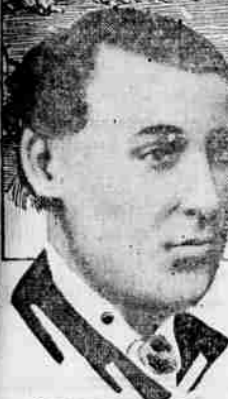
John C. Heenan, the "Benicia Boy" (upper right) who represented America, and Tom Sayers (lower left) who represented England in the first international heavyweight fight. Their battle is reproduced from an old wood cut.

So long as boxing lives, the first international battle for the world's heavyweight boxing championship will occupy a prominent place in the record books.