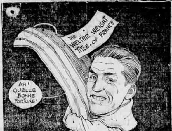
BRINGING HOME THE BACON