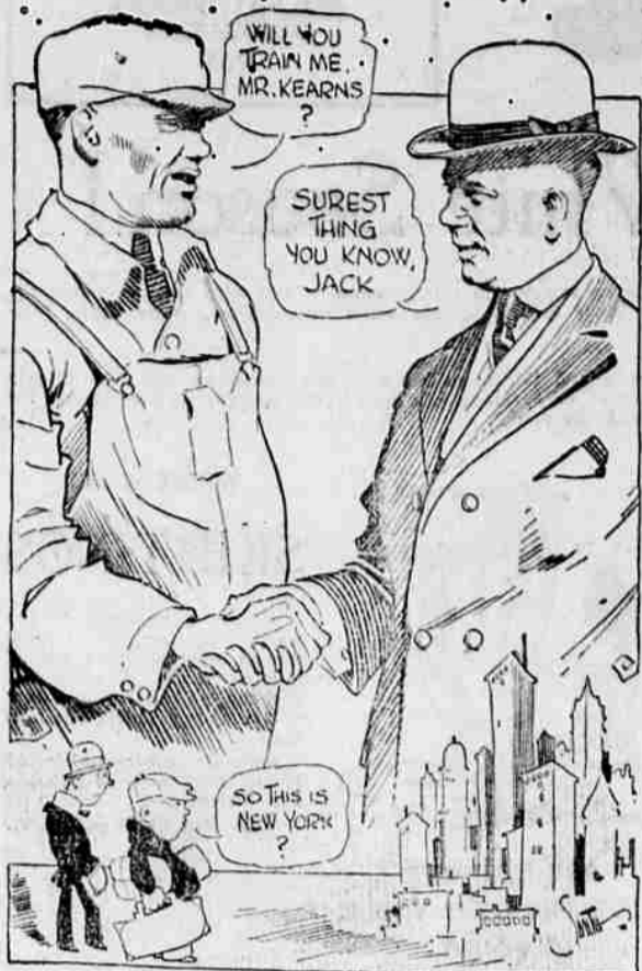
DEMPSEY'S FIRST TRIP TO NEW YORK WAS IN THE ROLE OF A REAL RUBE. THE NEXT TIME HE WENT EAST IT WAS UNDER THE MANAGEMENT OF JACK KEARNS.