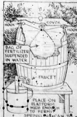
Diagram showing the barrel with faucet and suspension system for fertilizer.

With a faucet to draw off the liquid much of the back-breaking work of bending over to dip the fertilizer out is avoided and considerable time is saved. It becomes an easy matter to devote a few minutes a day to applying the fertilizer and refilling the barrel when necessary. The fertilizer should not be applied often, then once a week to any one vegetable or flowering plant.