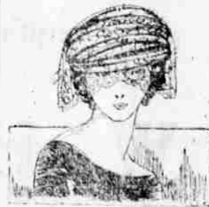
The Petit shapau of the moment a white taffeta turban with black lace frill

The hat for this costume is a turban in brown and silver brocade with brown Paradise branching from it in the horn-like fashion that is so popular this season. Note it particularly. Many dress hats, both large and small, feature Paradise, placed on the hats in this dashing manner. Those dress hats that do not carry Paradise are plumed with ostrich, and for the present these two types of trimming prevail.