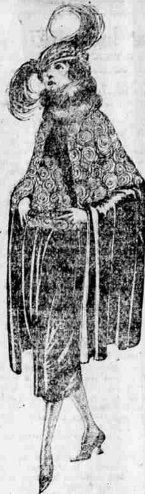
A Paris model wrap and frock that belong together, in dark brown velveteen with embroidery in wheels of tan and brown silk braid. The hat is of brown and silver brocade ribbon with brown Paradise.

less than hand embroidery in price, when all is said and done.