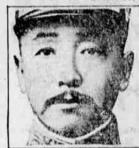
General Chang Tsao-Lin, the "Villa of China." Has things his own way in the northern provinces. He worries the Peking government just as Villa used to worry Mexico. He controls three provinces.