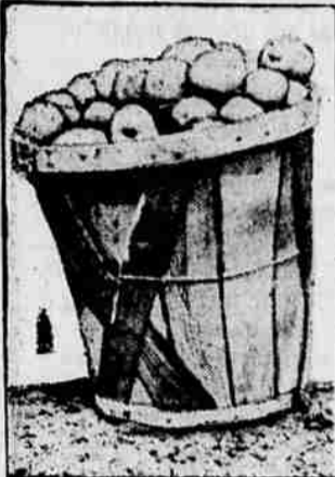
Satisfactory Basket for Potatoes.

Durability. —Much dissatisfaction with direct marketing has been caused by using containers which were not