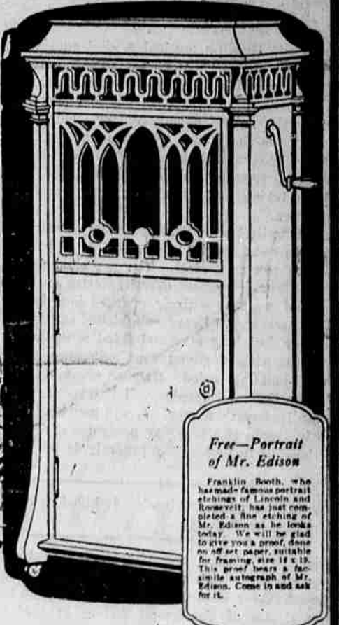
Free—Portrait of Mr. Edison

Franklin Booth, who has made famous portrait etchings of Lincoln and Roosevelt, has just completed a fine etching of Mr. Edison as he looks today. We will be glad to give you a proof, done on off set paper, suitable for framing, size 18 x 12. This proof bears a facsimile autograph of Mr. Edison. Come in and ask for it.