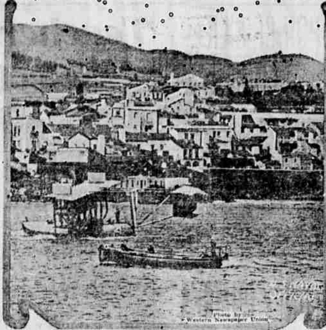
Ponta Delgada, With NC-4 in Harbor.

A IRMEN are preparing to make the Azores Islands the aerial junction of the future. They predict that this garden spot of the Atlantic, with its mild climate and other health giving qualities, will become the stopover for all overseas travel by airplane and dirigible. They point out that the exploit of the United States navy in effecting a crossing has virtually put the islands on the map, as far as the general public is concerned; that for many years problems of construction will limit the over-seas route to the Azores, where fuel and other supplies may be replenished, says the New York Tribune.