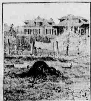
Don't Leave Manure in Piles Exposed to Weather Conditions Favorable to Loss By Washing—Use It to Make a Compost Heap.

Garden waste, decayed vegetables, dead vines, weeds, and the organic rubbish that collects about the place during a busy summer may be cleaned up and put to work again through the agency of a compost heap. Start the heap by laying down a bed of stable manure which has not been burned or heated. The size of the plot will vary with the amount of refuse to be used; for ordinary uses, if the bed is made 8 feet long by 6 feet wide and 2 feet deep it will serve the purpose. Over the manure spread a two-foot layer of refuse and cover it with another layer of manure. This last layer need be only a foot in thickness. Re-