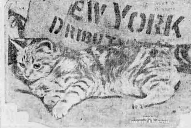
Contained in one of the thousands of bags of mail which arrived in New York on the liner Aquitania, was one live parcel which has not been accounted for. It was a blue kitten, which was in the sack for eight days without water or food.