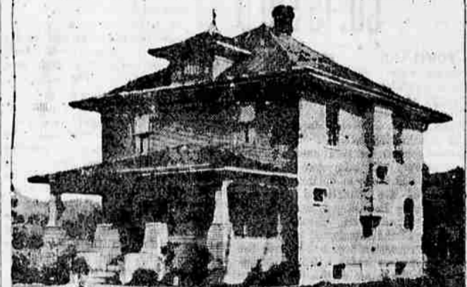
class residential section in a large town or city.

That this is true is borne out by the picture and floor plans of the farm home shown here. This house could very easily grace the streets of a high-