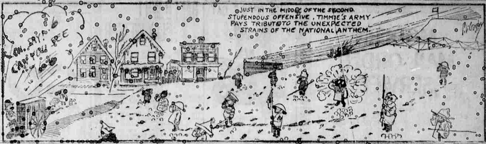
JUST IN THE MIDDLE OF THE SECOND STUPENDOUS OFFENSIVE, TIMMIE'S ARMY PAYS TRIBUTE TO THE UNEXPECTED STRAINS OF THE NATIONAL ANTHEM.

Series Results From Colds. Colds not only cause a tremendous injury to every one who contract them but are also a serious financial loss but are also a serious threat to the vitality of the body. It is not at all unusual for people who have serious lung trouble to say, "I had a hard-cold last winter." Why not take Chamberlain's Cough Remedy and cure your cold while you can. -Adv.