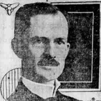
Hon. J. Hampton Moore.

This veteran law-maker who has been one of the leading Republicans in the National House of Representatives for fifteen years, has just been elected Mayor of Philadelphia. He won a notable victory in the recent election, and upon his temporary return to his seat in Congress, he was given a high ovation by all members.