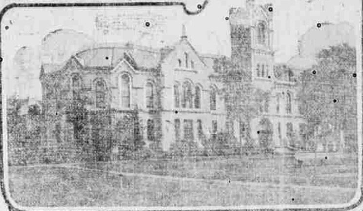
The Arts Building