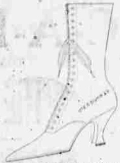
UTZ & DUNN SHOES

For Ladies, Men, Boys and Children—Bring the Whole Family Here For Shoes.