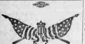
"My Country 'Tis of Thee, Sweet Land of Liberty."

SUBSCRIPTION RATES By Carrier Daily, per month... $1.50 Daily, per three months... $4.50 Daily, per six months in advance... $8.50 Daily, per year in advance... $15.50 Daily, single copy... 5c By Mail Daily, per year in advance... $15.00 Daily, per six months in advance... $8.00 Daily, three months in advance... $4.50 Daily, per month... 50c Weekly Observer-Star, by mail, per year in advance... $1.50