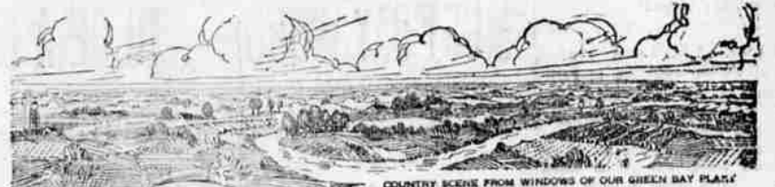
COUNTRY SCENE FROM WINDOWS OF OUR GREEN BAY PLACE