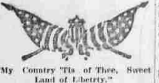
"My Country 'Tis of Thee, Sweet Land of Liberty."

Let the showmaker stick to his last. A great deal of mischief is done, right along in American affairs, by attaching too much importance to the utterances of brilliant specialists outside of their own specialties.