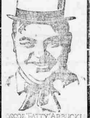
OSCOE BATTY ARBUCKLE "Camping Out"