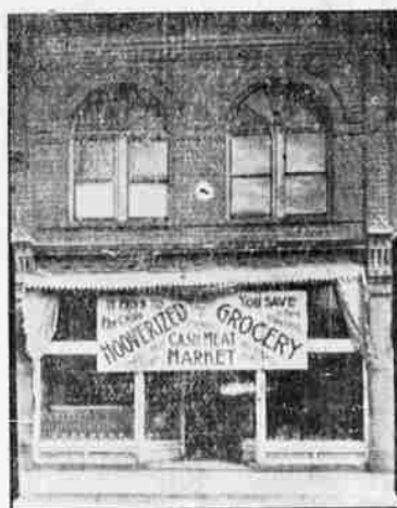
Our Store in 1918

The fact that this store fulfills every requirement—Quality, LOWEST PRICE , and General Satisfaction—in conclusively shown by the many recommendations brought in from them—by new Customers.—This is not only gratifying to us, but should appear attractive to you, if you are inclined to "Economy" and Thrift—Visit our store—see the "difference" between OUR PRICES for first quality groceries and CREDIT STORE PRICES —No war time prices, but a store full of contented, anxious customers— OTHERS SAVE MONEY, WHY NOT YOU?