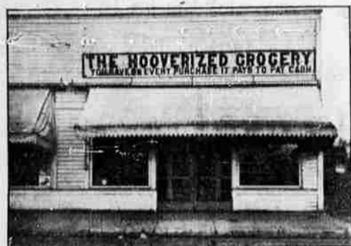
Our Store December 16, 1917