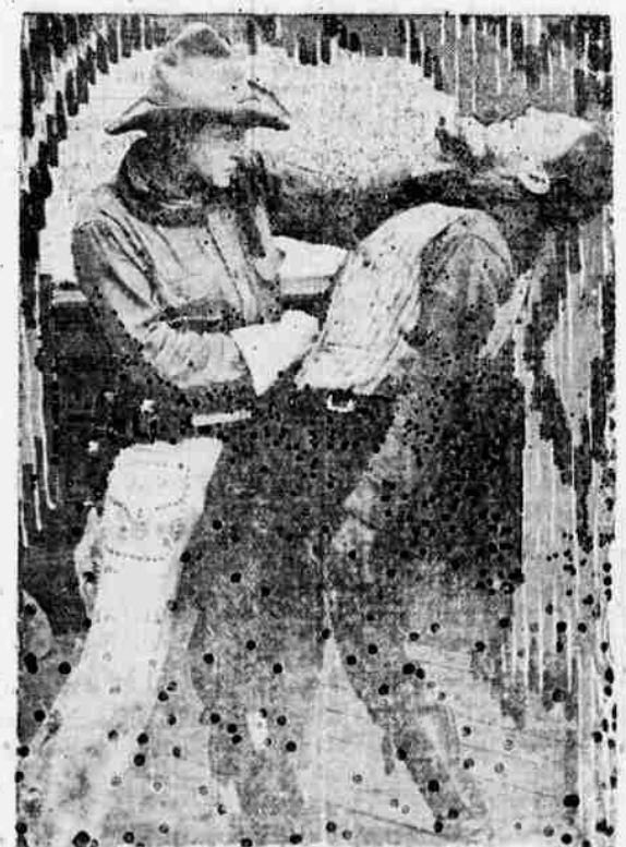
THE PICTURE OF A HUNDRED THRILLS.

ZANE GREY'S GRIPPING ROMANCE OF THE BORDER.