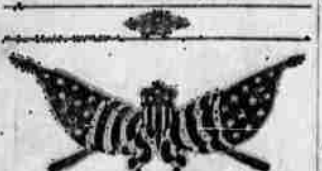
"My Country 'Tis of Thee, Sweet Land of Liberty."

SUBSCRIPTION RATES By Carrier Daily, per month $1.00 Daily, per three months $2.50 Daily, per six months $4.50 Daily, per year in advance $7.50 Single copy, 5c