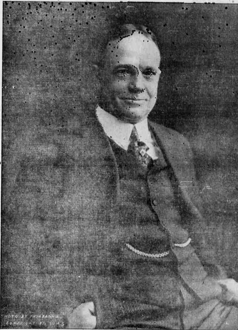
W. A. (Billy) Sunday, famous evangelist and ex-baseball player, who is banner morning attraction at the La Grande Fourth of July Celebration, and who has expressed his warm friendship for the La Grande Chautauqua, both by voice and check.

TRANSMISSION IS REWARDED What does your business need of transmission to the Park? With the transmission you get the best of both worlds. The car has no more vibration, and the motor averages 1,000 strokes a minute, while the old foot-driven machine accomplishes only 300 or 400 strokes a minute at most.