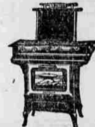
THE DETROIT VAPOR OIL STOVE

Note how comfortably the large man and the small boy are resting. The Way Sagless Spring, which does not permit the occupants to roll to the center, is the reason. Price $13.50