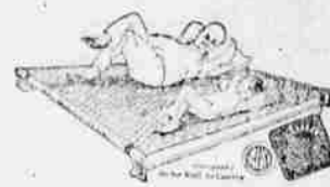
THE NON RUST WAY SAGLESS SPRING

Note how comfortably the large man and the small boy are resting. The Way Sagless Spring, which does not permit the occupants to roll to the center, is the reason. Price $13.50