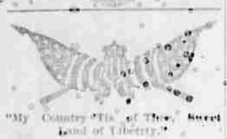
My Country 'Tis of Thee, Sweet Land of Liberty

SUBSCRIPTION RATES: Daily, per month $1.00; Daily, per three months $2.75; Daily, per six months $5.00; Daily, per year in advance $9.00