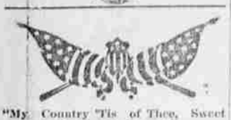
"My Country 'Tis of Thee, Sweet Land of Liberty." The Roosevelt Highway Needed.

SUBSCRIPTION RATES By Carrier Daily, per month $1.50; Daily, per three months $4.50; Daily, per six months in advance $8.75; Daily, per year in advance $17.50; Single copy, 5c. By Mail Daily, per year in advance $15.00; Daily, per six months in advance $8.25; Daily, three months in advance $4.25; Daily, per month, 60c; Weekly Observer-Star, by mail, per year in advance $1.50.