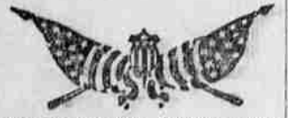
"My Country 'Tis of Thee, Sweet Land of Liberty."

Subscription Rates: Daily, per month .65c; Daily, per three months $1.95; Daily, per six months in advance $3.75; Daily, per year in advance $7.50.