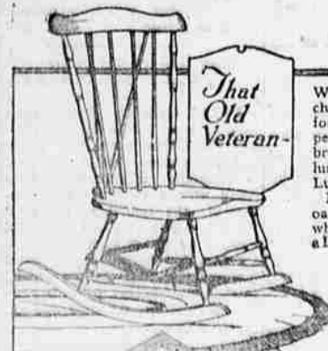
That Old Veteran

"The Barrier," by Rex Beach at the Star, Saturday and Sunday 4-8-19