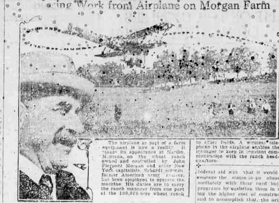
Bringing Work from Airplane on Morgan Farm