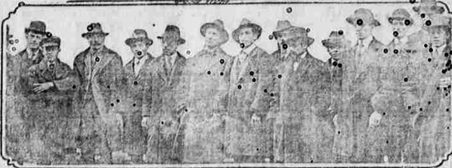
Here are "fourteen points" against peace. In fact this group of men are the Champions "Agitators" of everything. They are the fourteen Spanish anarchists arrested in New York and Philadelphia, charged with plotting against President Wilson. They were arrested the day before the president landed from France. They are shown here while being taken to Federal Court.