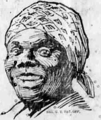
"Tap in town, Honey!"

For variety serve Aunt Jemima Buckwheat Cakes. You'll say they are the best buckwheat cakes you ever tasted! Get a package of each from your grocer today. Aunt Jemima Pancake Flour in the red package, Aunt Jemima Buckwheat Flour in the yellow package.