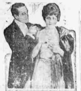
ELSIE FERGUSON "The Song of Songs"