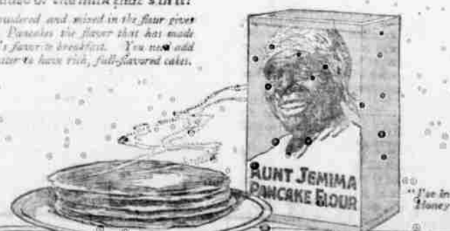
"I've been using Honey!"

Sweet milk, powdered and mixed in the flour gives Aunt Jemima Pancakes the flavor that has made them America's favorite breakfast. You need add nothing but water to have rich, full-flavored cakes.