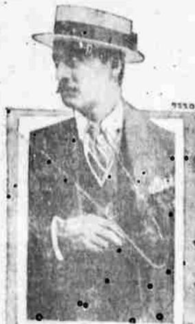
JOHN BARRYMORE "The Man from Mexico" A Paramount Picture