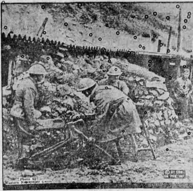
These American soldiers are taking German machine guns out of one of the dugouts that were filled with guns and ammunition left behind by the Germans in their retreat from France. The men are of the One Hundred and Third Infantry of the Twenty-sixth division.

...nishing of financial assistance to farmers who are not in a position to furnish real estate security for such loans. In this connection he suggests that personal credit unions, established preferably by the state governments, would satisfactorily answer the purpose.