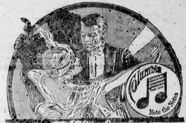
JANUARY RECORDS JUST IN

Mississippi steamboats whistling through some clever novelty chorus, haunting love songs from the latest opera hit, patriotic music, military marches—any piece that's catchy, tuneful, bubbling with the joy of life—that you'll find, and find it FIRST, on a Columbia Record.