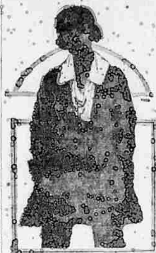
BILLIE BURKE in "In Pursuit of Polly"

Did you ever watch a fellow nearly break his neck and fairly burst his heart trying to catch a girl, only to lose her? If you have you'll sympathize with the poor cuss who does it in "In Pursuit of Polly."