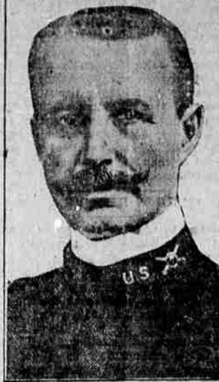
Maj. Gen. C. G. Treat, commander of the American army in Italy.

The Difference. "A great difference between the human mouth and a city street," observed the facetious philosopher, "is that a street is closed for repairs, while a mouth is opened."