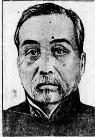
Hsu Shih Chang is the new president of the Chinese republic.