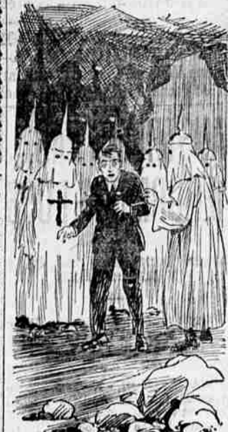
Silent, Daring and Terrible.

Mobile, Ala.—The first "Invisible Empire," which was brought into being by General Forrest after the Civil War to offset the evils of the carpet-bag rule in the Southern states, has been succeeded by a second "Invisible Empire." The Ku Klux Klan, silent, daring and terrible, is once more organizing in many localities of the South. First of all the new organization is on the lookout for alien enemies, for the disloyal and for the fellow who is seeking to begin a strike.