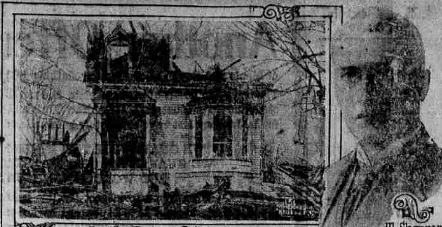
In the Path of the Blast