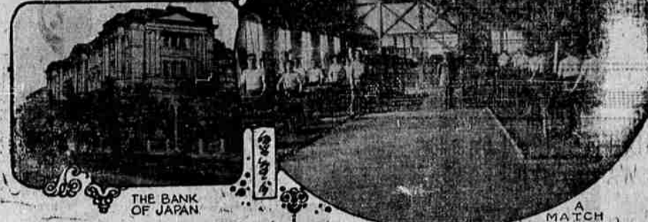
THE BANK OF JAPAN